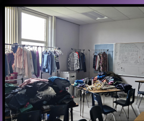
MMS Community Closet Pics...